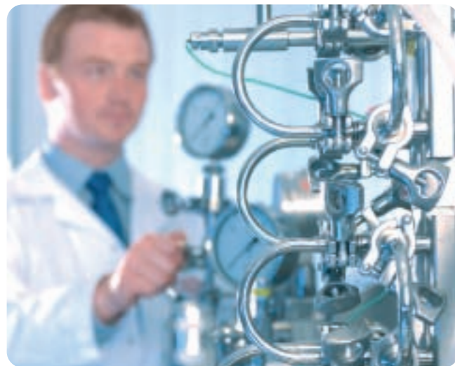
The modern UHT plant in the Hydrosol-Technikum