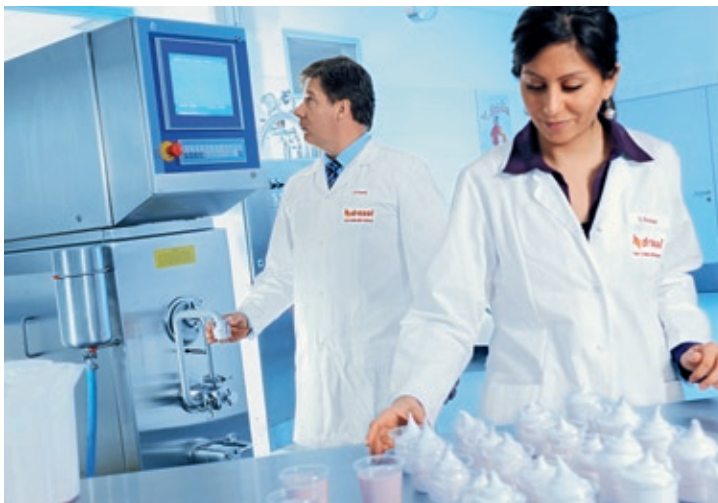
Ice freezer in the ice cream laboratory