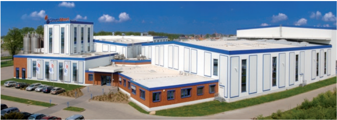
Hydrosol production plant in Wittenburg, near Hamburg