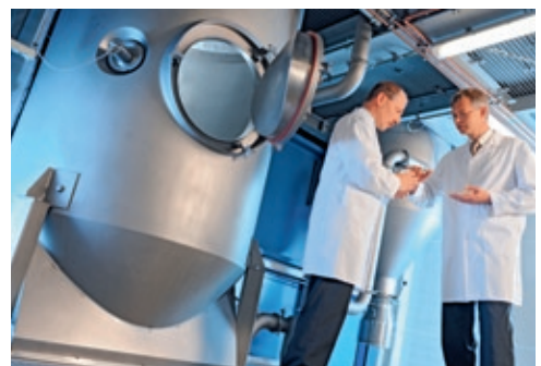
Certain combinations of emulsifiers have quite different functional properties when spray-dried together