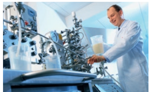
Pasteurizing and homogenizing in the ice cream laboratory

The modern Technology Centre of the Stern-Wywiol Gruppe is unique in size and technical equipment for a company independent of the big organizations. The Centre concentrates the group's applications technology under one roof in 10 laboratories, where our development engineers work on new compounds of active substances for the food industry in interdisciplinary teams on an area of over 2,000 m 2 .