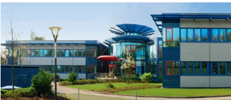
The Technology Centre in Ahrensburg, near Hamburg